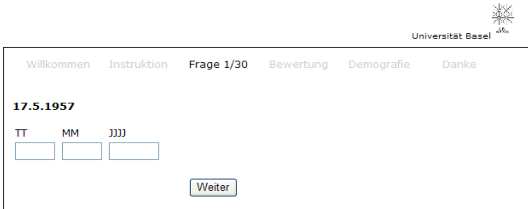
Figure 5. Example on how the task was presented to the user.

The task for participants was to fill in the date presented into the input field as fast as possible and to click on the button to proceed to the next screen. In line with the stated format requirements, dates had to be entered using two digits for the day and the month and four digits for the year. At the end, a post-test questionnaire appeared with each condition presented again on the same screen and the questions “Filling in the date was comfortable” and “I could fill in the date quickly and efficiently” were placed under each condition. Subjects had to rate these two questions for each condition on a six-point Likert-scale. Finally, participants were asked for their age and gender and thanked for their participation.